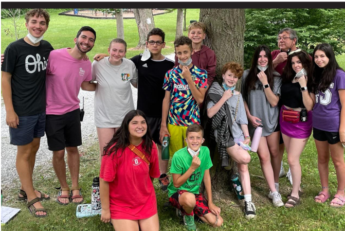
GUCI 2022 1st Session (top) and 2nd Session (bottom)

Go to ValleyTemple.com and click on "Giving"