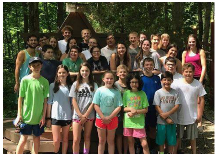
SECOND SESSION CAMPERS

We are proud to report that this summer we had a record number of campers and staff who participated at Goldman Union Camp Institute—including our rabbi! Given the size of our congregation, a greater percentage of our kids participated than any other congregation in the region!