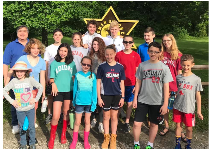
FIRST SESSION CAMPERS