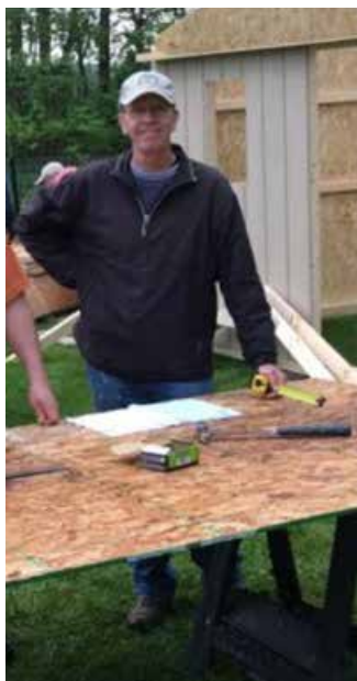
MEN'S CLUB WORK WEEKEND AT GUCI.