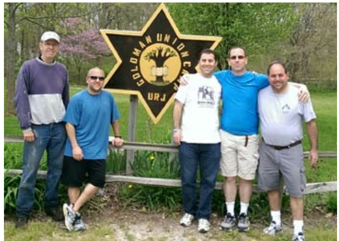
MEMBERS OF MEN'S CLUB AT GUCI

Wings & Trivia will continue throughout the Summer so keep an eye on the Men's Club Facebook page and for email blasts!