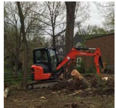
Day 1 -- Clearing the Land

P.S. I have been asked to remind those who pledged to consider making your 2015 capital campaign payment as soon as possible to allow us to finance as little as possible. Since most pledges are spread over three years, most will not complete their gift until 2016. The more cash on hand, the less we will need to finance on a short term loan(with interest).