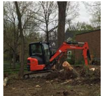
Day 1 -- Clearing the Land

P.S. I have been asked to remind those who pledged to consider making your 2015 capital campaign payment as soon as possible to allow us to finance as little as possible. Since most pledges are spread over three years, most will not complete their gift until 2016. The more cash on hand, the less we will need to finance on a short term loan(with interest).