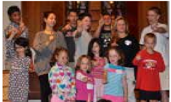
Graduating 12th graders and 8th graders sing Shema with the kindergartners at the closing Religious School assembly.

Religious School programming is made possible by a generous grant from S.E.E.D, a project of the Cincinnati Jewish Federation