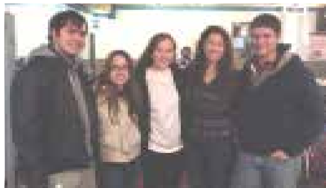
Youth Group attends Martin Luther King, Jr. March in downtown Cincinnati