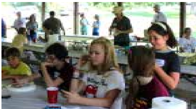
Fun at the 2013 Picnic