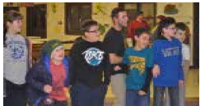
This year's retreat was subsidized by grants the Jewish Federation of Cincinnati's SEED program as well as the Jewish Foundation of Cincinnati.